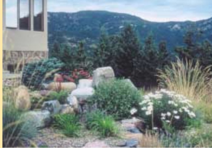
A stunning example of a xeric landscape